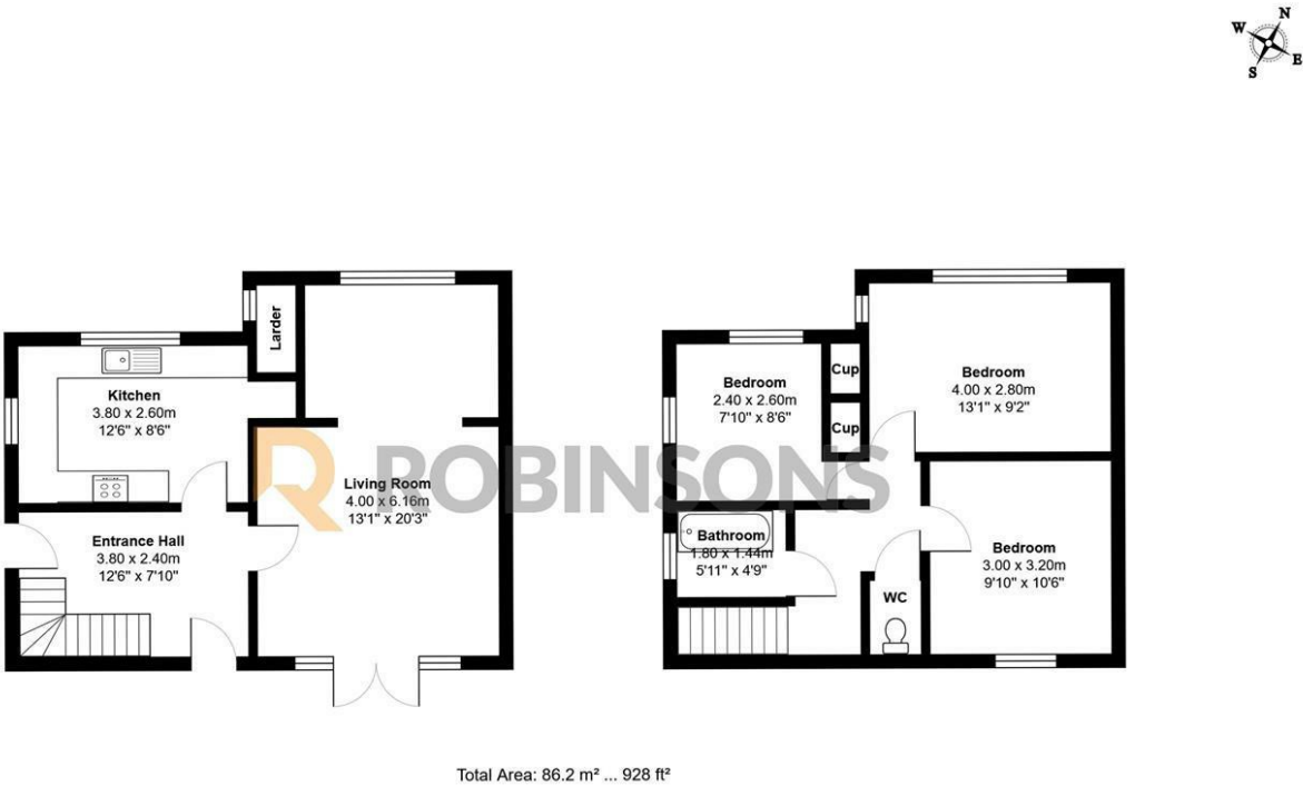
Floorplan produced by Woodside Photography Floorplan is for illustration purposes only and all measurements are approximate

With excellent potential for extension (STPP) and positioned within easy walking distance of highly regarded schools including Beecroft Academy, Ashton St Peter's and Dunstable Icknield Lower School, this is a fantastic family home offering space, convenience and long-term potential.